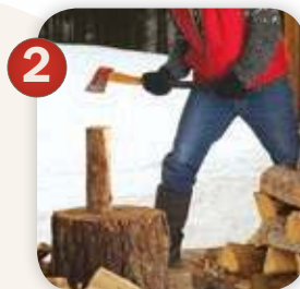
E xercise & other physical activity