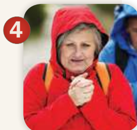
E xtrême cold weather