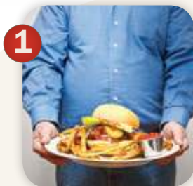
E ating a large meal