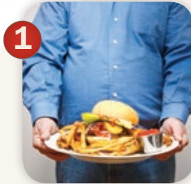
1 Eating a large meal