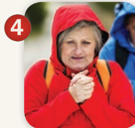
4 Extreme cold weather