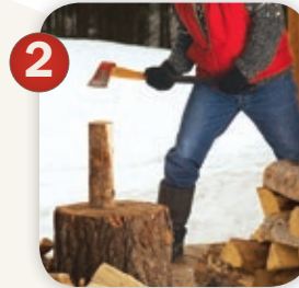
2 Exercise & other physical activity